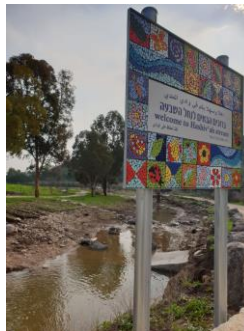
Ha'Shiva Stream with mosaic sign