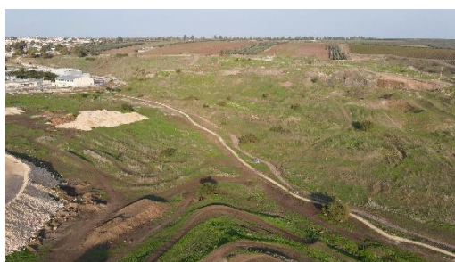
Kama Stream – near Kfar Kama

The stream begins near the Circassian village of Kfar Kama, then runs south along the Lower Galilee areas until it spouts to Tavor stream, south to Kfar Kish. The stream follows four populations: Kfar Kama, Shadmot Dvora, Kfar Kish and the agriculture lands of Kfar Tavor. Kama stream runs through and connects rural settlements, fields, agricultural plantations, and natural areas. Along the stream you can find various attractions and a hiking path that connects them to one another: the H'amisha spring, Love Trees Grove, Omer park, Ein Sera, Ma'ale Kish, and the streams meeting point.