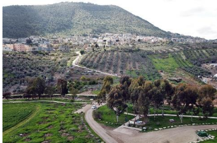
Mt. Tavor , Shibli village and

The mosaic slab you received will be part of a sign in Ha'shiva stream.